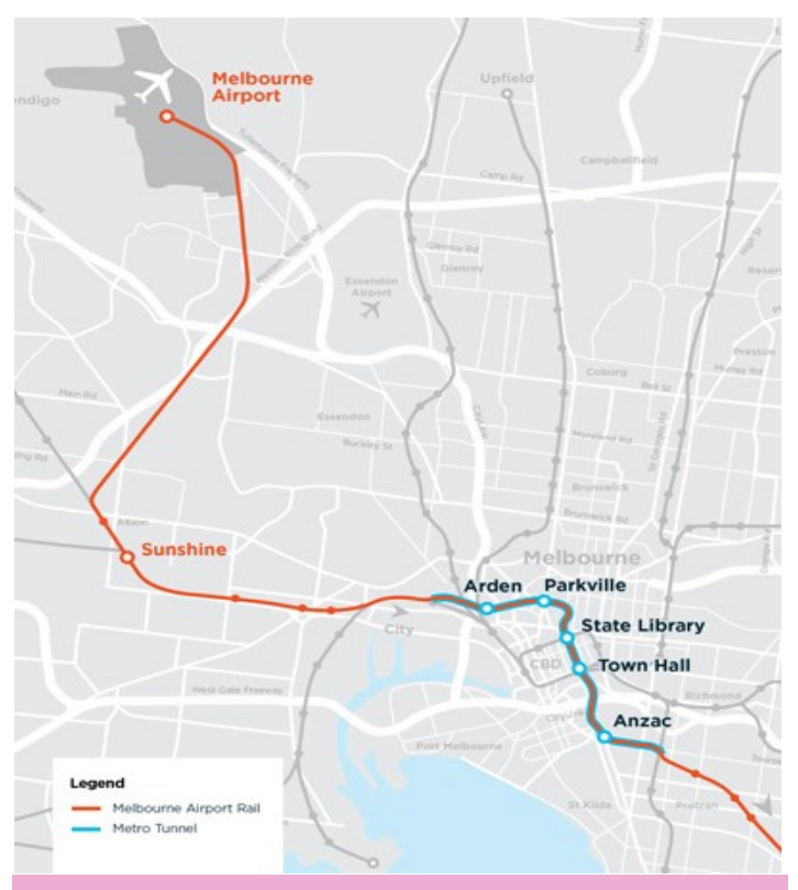
THE MELBOURNE AIRPORT RAIL LINK

The focus of efforts through the School for the Visitor Economy has been to work with industry on recovery planning with a focus on identifying education, training and research needs going forward. With our partners at the Victoria Tourism Industry Council (VTIC), we are soon to complete our state-wide study of the impacts of bushfire and the pandemic on the visitor economy and to map how we might build resilience to shocks going forward. We look forward to reporting on the outcomes of that project at Visit Victoria's annual update