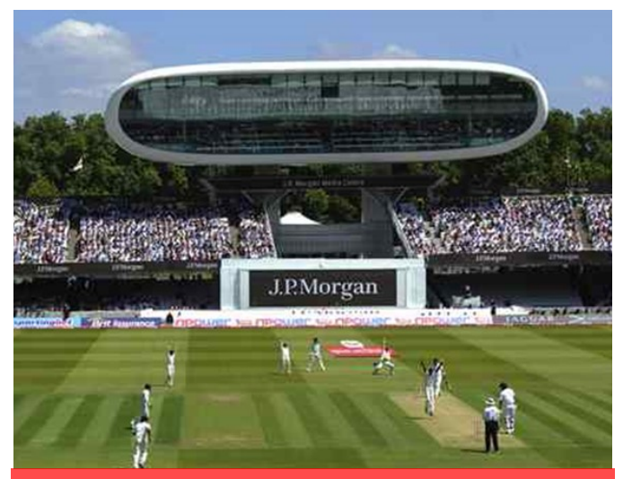
LORDS, THE MECCA OF CRICKET, IS UNDERGOING A MAJOR REVAMP

examining the use of digital technologies by small businesses – including non-profit organisations like local sporting clubs – the authors confirm that medium-sized businesses adopt digital technologies at a faster rate than their small- and micro-sized counterparts.